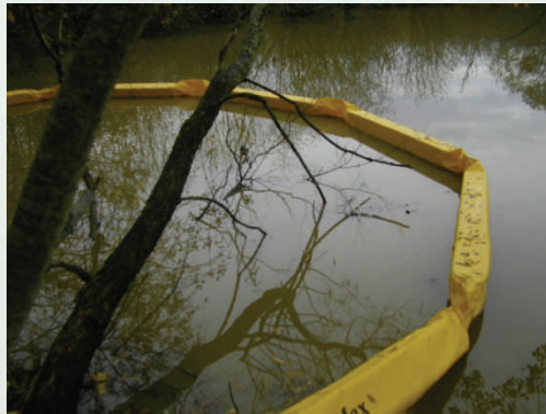
Type 1 DOT Silt Barrier

This is a basic guide to installing Granite Environmental Silt Barriers . It is in no way comprehensive and is limited to generic information as each site is unique, along with contractor ability and equipment available for use. Please contact us to discuss designs, layout and performance requirements.