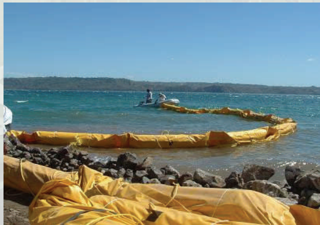
Deploying Silt Curtain with Small Boat

The curtain should be furled/reefed up to the flotation by tying a reefing line around the flotation log. This will make it easier to maneuver when towing to position. When towing the curtain into the water, take care not to allow the curtain to become twisted. Avoid sharp objects or areas which may damage the curtain when deploying it.